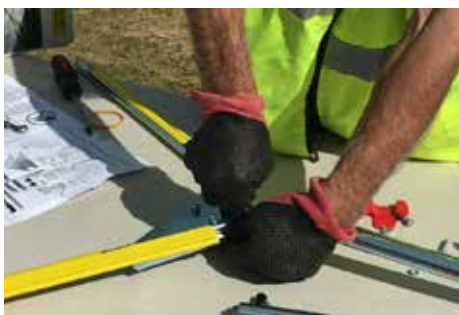
Gloves must be worn to assemble & operate the Aquatic Weed Razer.