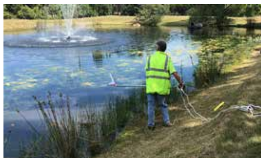
Light enough to throw up to 8m or further.