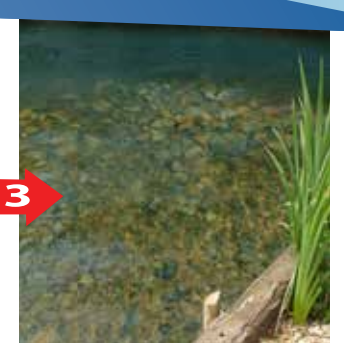
3. It removes phosphorous (algae's food source).