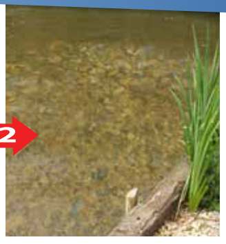
2. It clears water by floculating sediment particles.